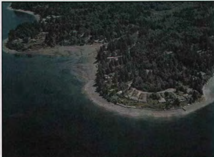
Thurston Regional Planning Council

Mapping critical areas, such as this Thurston County shoreline area, can help determine where dense development may or may not be appropriate in the rural area.