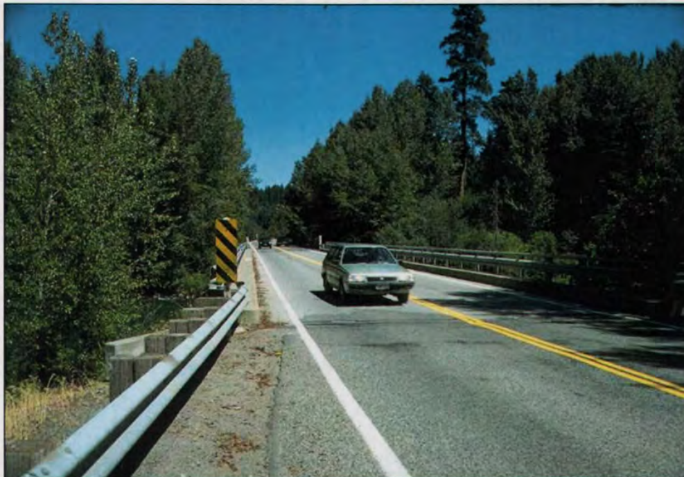
Rita R. Robison

Each community should adopt a functional classification system to group streets and roads according to the level