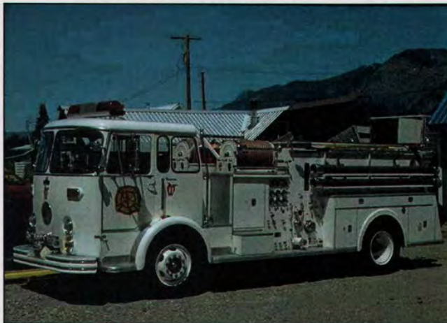
Rita R. Robison

[T]hose public services and public facilities historically and typically delivered at an intensity usually found in rural areas, and may include domestic water systems, fire and police protection services, transportation and public transit services, and other public utilities associated with rural development and normally not associated with urban areas. Rural services do not include storm or sanitary sewers, except as otherwise authorized by RCW