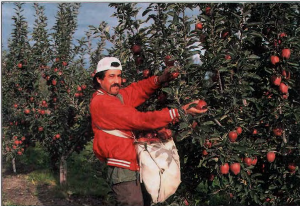
Washington State Apple Advertising Commission

Agriculture is important to the economy for many counties.