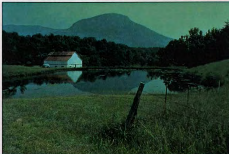
Growth Strategies Commission

Before beginning its rural planning, a county needs to have adopted a critical areas ordinance, including measures to protect wetlands.