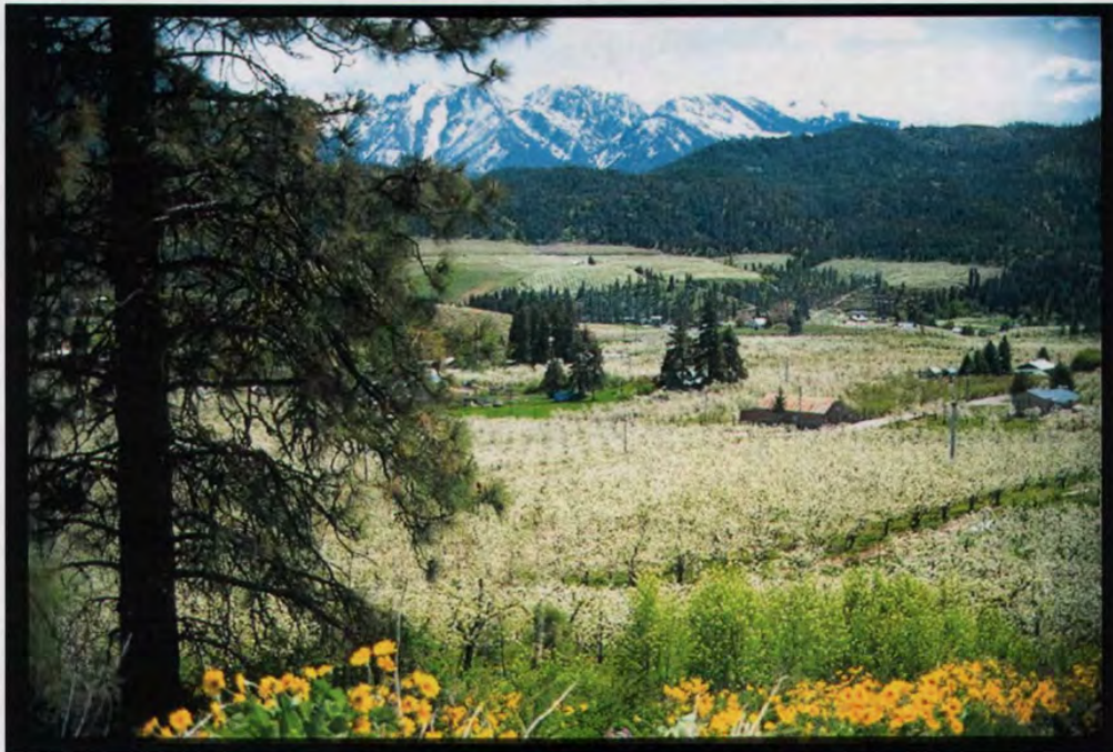
Washington State Apple Advertising Commission

Counties need to continue to be flexible and creative in how they reconcile existing development patterns and provide for future development in the rural area. They must balance the needs of rural residents with protection of those parts of the rural environment that contribute to every citizen's quality of life and economic and physical well-being.