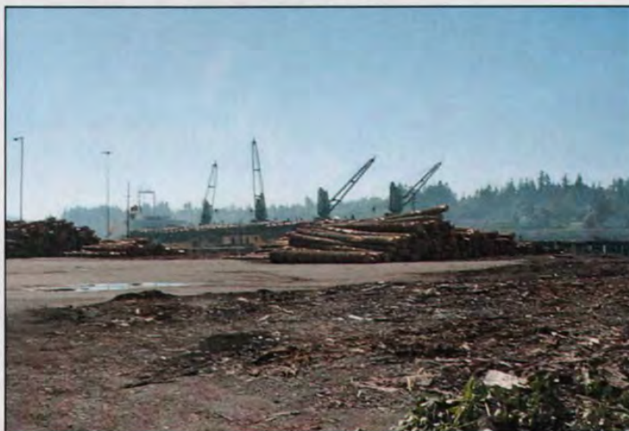
Washington Forest Protection Association

Effective rural planning can help small non-industrial forest landowners remain in production in rural areas.